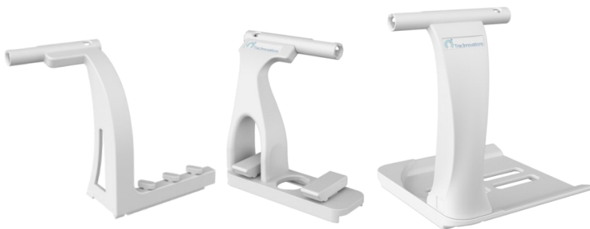
Siemens Magnetom Prisma/Skyra/Vida