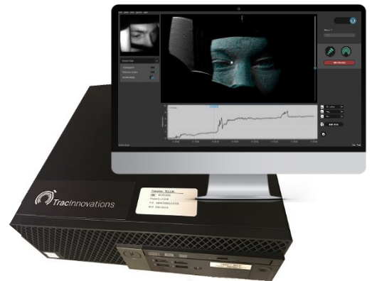
TracSuite workstation Controlling the system software