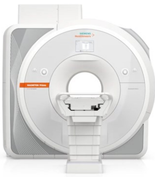
Siemens Magnetom Prisma, 3T