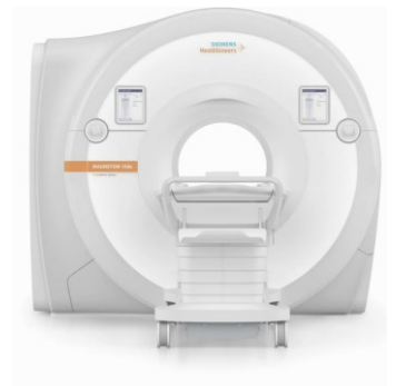
Siemens Magnetom Vida, 3T

- configured with the Siemens Head/Neck 64 Ch head coil