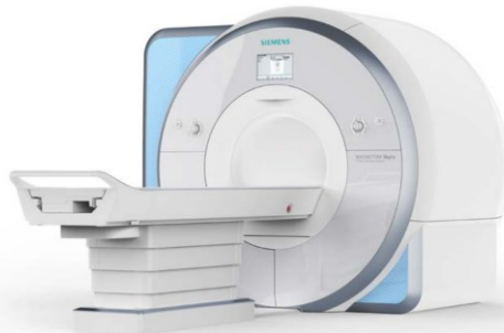
Siemens Magnetom Skyra, 3T